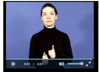
CONGRATULATIONS: {SignBank 3240} "Good" hand formations, move in alternating forward circles in front of the body.